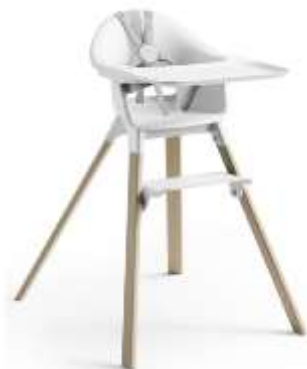
Stokke Recalls Clikk High Chairs Due to Fall and Injury Hazards | CPSC.gov

What to do: Consumers should immediately stop using the recalled white high chairs and contact Stokke for a free replacement. Consumers will receive the free replacement Clikk high chair in white after visiting Stokke's website to confirm their product is included in the recall and registering the product online. Consumers can also contact Stokke toll-free at 877-978-6553 from 9 a.m. to 8 p.m. ET, Monday through Friday email at info-usa@stokke.com online at https://recall.stokke.com/cliikkwhite or www.stokke.com and click on "Product safety and recall information" at the bottom of the page for more information.